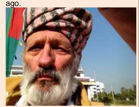
In India, you can really wear a turban

casting director for our film magnetized you those many moons